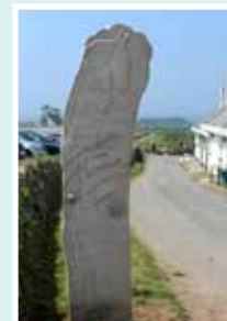
White Horse Sculpture at Rhossili Bay Cerflun Ceffyl Gwyn ym Mae Rhossili by/gan Sara Holden