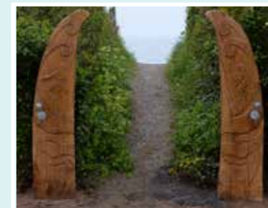
Surf / Windsurf Arch at Horton Bay Cerflun o Fwa Syrffio/Hwylfyreddio ym Mae Horton by/gan Sara Holden