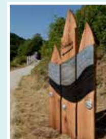
Surfboards & Fish at Caswell Bay Byrddau Syrffio a Pysgod ym Mae Caswell by/gan Ami Marsden