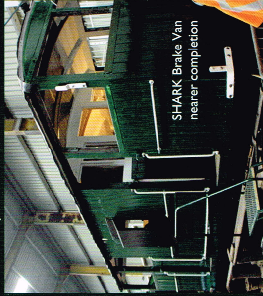
SHARK Brake Van nearer completion

Even before the coming of deep mining there was coal extraction, still to be found everywhere. There are numerous drift mines in the sides of the valley. Deep mining came to the valley in 1855 when the Garw colliery was opened in Blaengarw; and continued until 1985 when the last three pits in the valley (by now connected together below ground), the Ocean, the International and the Ffaldau closed. By that time they were producing around 1200 tons a day sufficient for a daily visit by a British Rail Class 37 diesel locomotive and qty.32 (32ton) wagons, to take it away, usually to a local power station